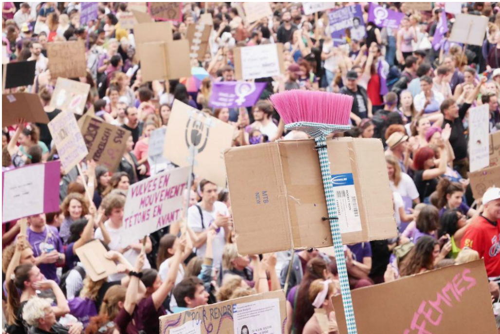
2019. Swiss Feminist Strike. Lausanne