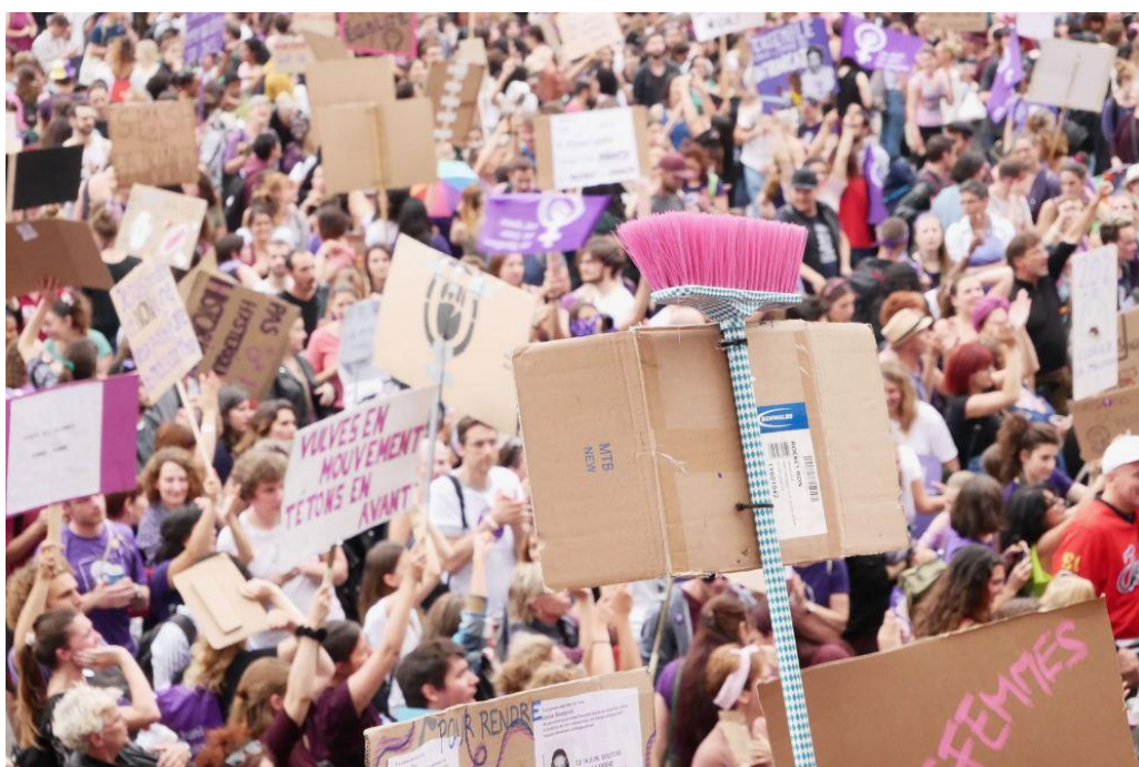
2019. Swiss Feminist Strike. Lausanne