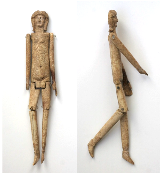
Bone articulated doll, Sambon Collection, Milano, © Sabap-Mi, Ministero della Cultura